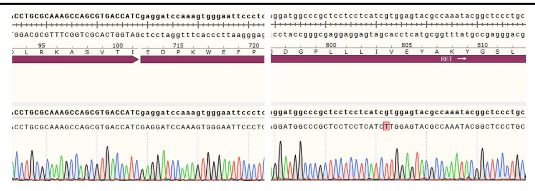
Figure 2 | The CCDC6-RET mutation analysis by Sanger sequencing.

Toll-free: +86 400 627 9288 Email: service@genomeditech.com